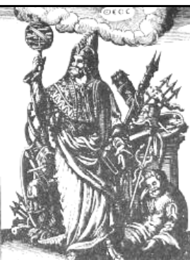
(above right) Hermes Trismegistus' most famous dictum is "As above, so below." This means that when man is able to understand himself, he too shall know the secrets of the universe.

People from all walks of life are welcome to study these under the Order. At present, the members include professionals (doctors, writers, lawyers, IT/computer professionals, teachers, etc.), as well as university students, housewives, grandparents, and people with different religious backgrounds. Their purposes in joining the Order are also often varied, but these can be summed up in one word: advancement .